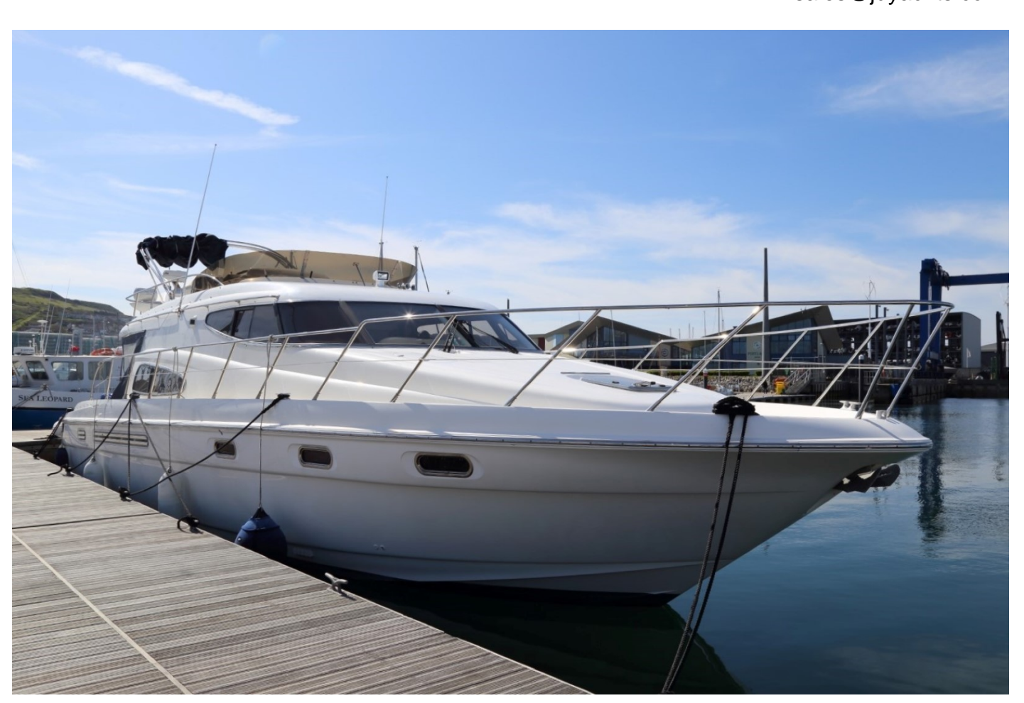
SEALINE T51 WAKEY WAKE

Tel: +44 (0)1305 766 504 sales@jdyachts.com