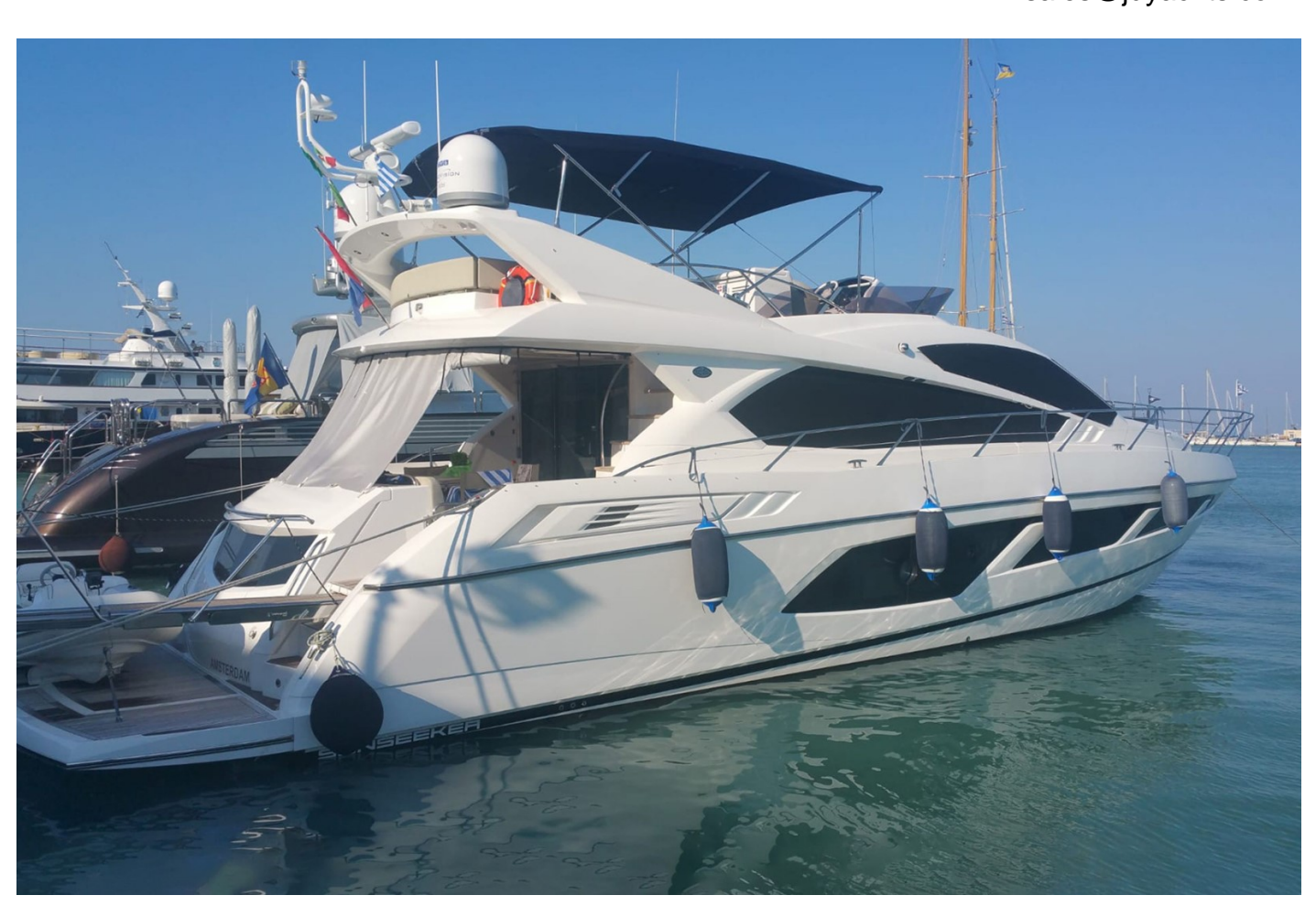
SUNSEEKER MANHATTAN 65

Tel: +44 (0)1305 766 504 sales@jdyachts.com