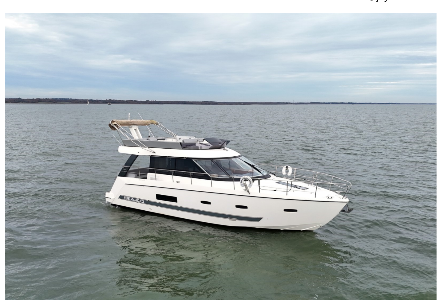
SEALINE F42 SEA E O

Tel: +44 (0)1305 766 504 sales@jdyachts.com