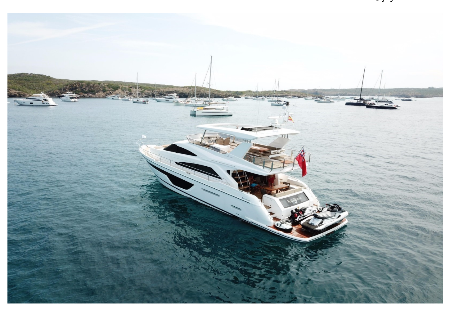
FAIRLINE SQUADRON 65

Tel: +44 (0)1305 766 504 sales@jdyachts.com