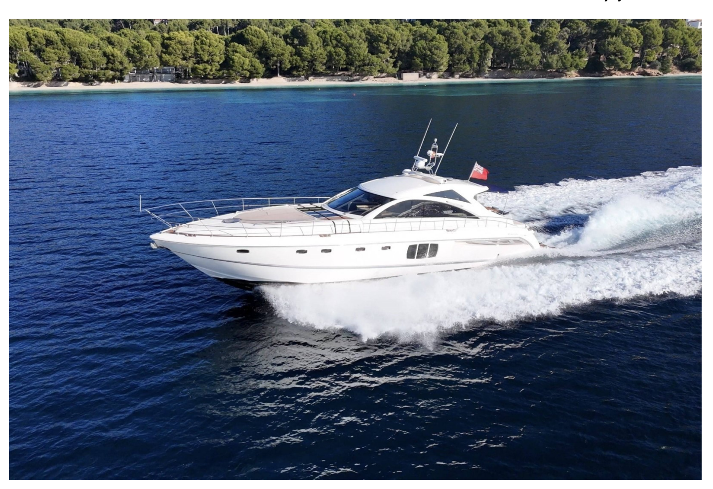
FAIRLINE TARGA 64 GT