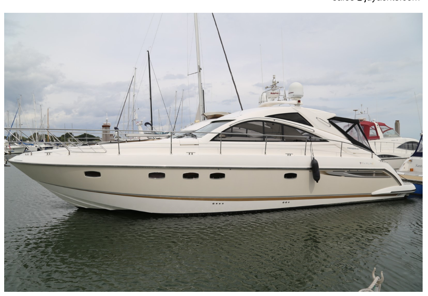
FAIRLINE TARGA 47 GT FOLLOWING THE SUN

Tel: +44 (0)1305 766 504 sales@jdyachts.com